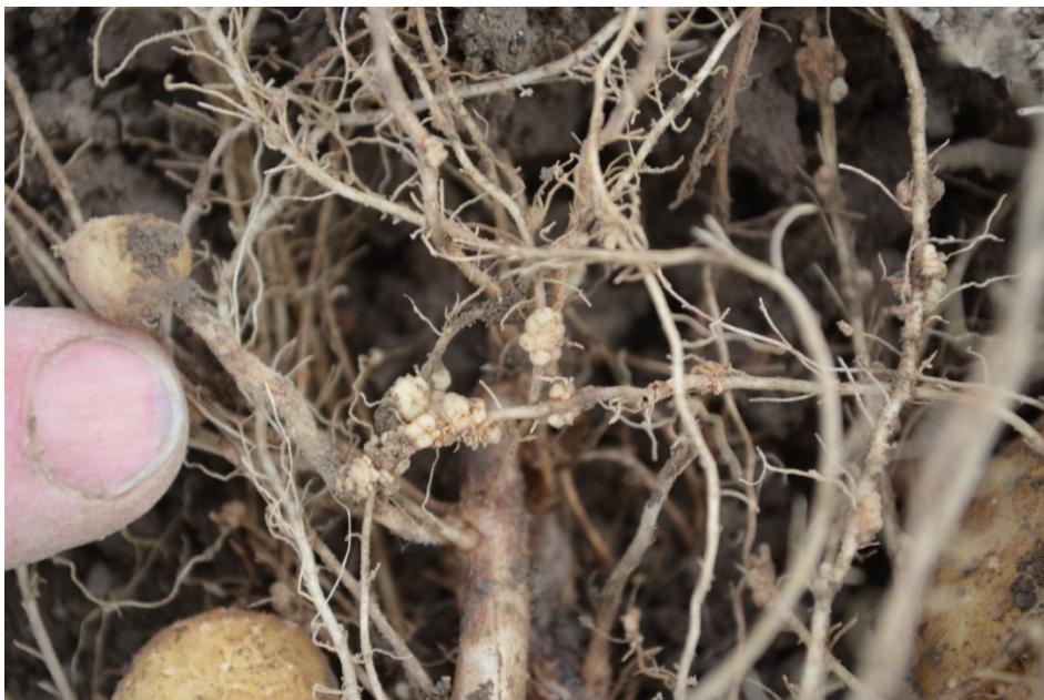
Spongospora root galls