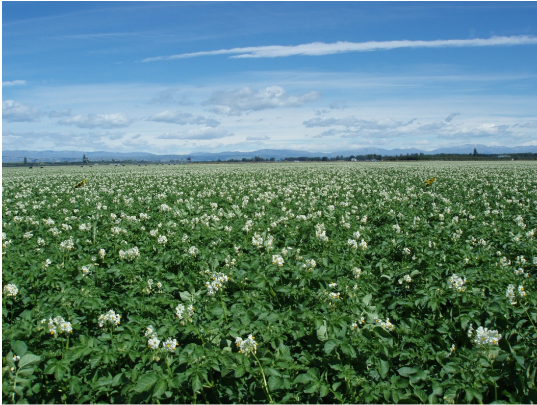
Canterbury potato crop, surveyed in 2012/13