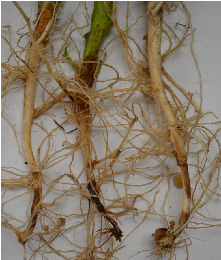
Typical stem canker lesions