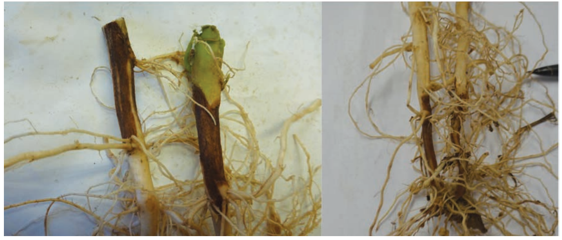
Figure 2. Soil-borne Rhizoctonia stem canker symptoms (left), seed-borne symptoms (right).

Table 2. Treatment effect on potato tuber mean marketable yield (t/ha) at Levels, South Canterbury in the 2016/17 season.